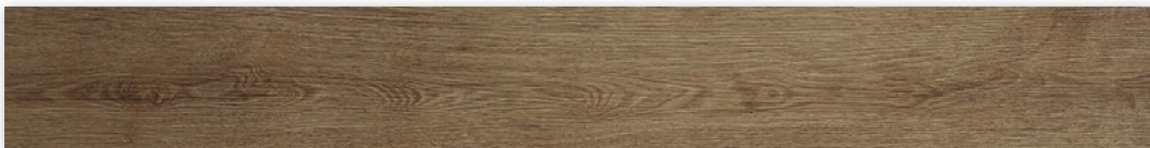
Woodland 7" x 59" Medium PO2451-075901