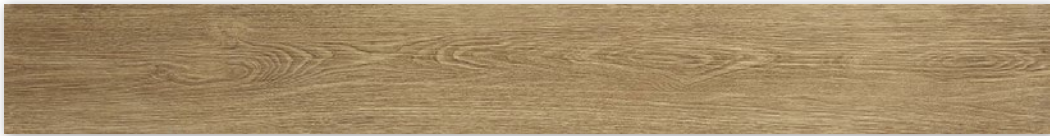
Woodland 7" x 59" Light PO2450-075900