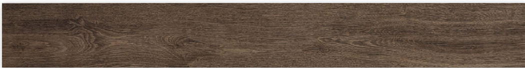
Woodland 7" x 59" Dark PO2452-075902