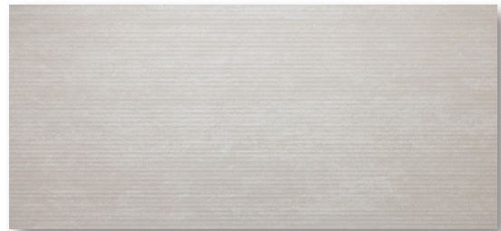
Travertino 20" x 48" Sand Crease (M) Ceramic CR2817-2048CR