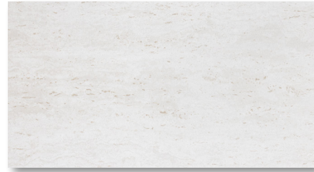
Travertino 12" x 24" White (M) PO2816-1224M0