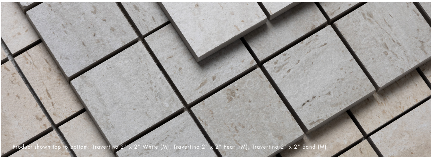
Product shown top to bottom: Travertino 2" x 2" White (M), Travertino 2" x 2" Pearl (M), Travertino 2" x 2" Sand (M)

Due to the inherent characteristics of ceramic, there may be variations in color, movement, and texture from lot to lot. For detailed installation guidelines, visit akdo.com .