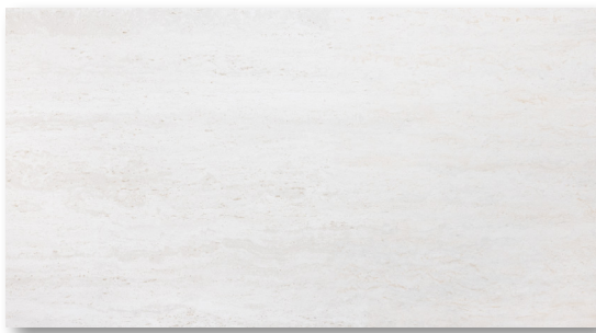
Travertino 24" x 48" White (M) PO2816-2448M0