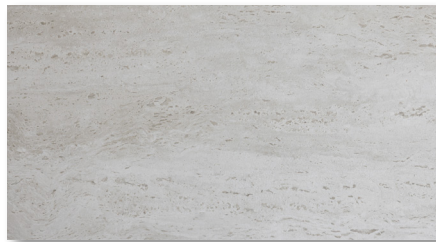
Travertino 12" x 24" Pearl (M)