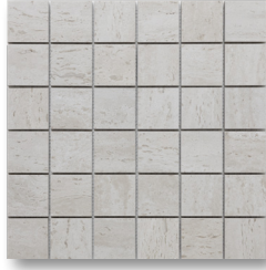
Travertino 2" x 2" Pearl (M)