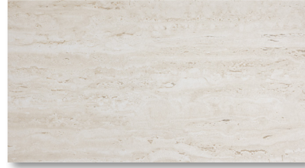
Travertino 12" x 24" Sand (M) PO2817-1224M0