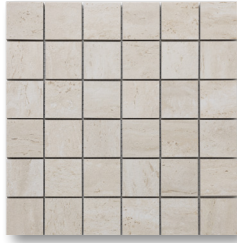
Travertino 2" x 2" Sand (M) PO2817-0202M0