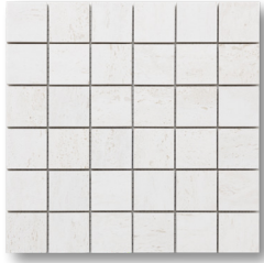
Travertino 2" x 2" White (M) PO2816-0202M0