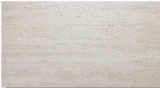
Travertino 24" x 48" Sand (M) PO2817-2448M0