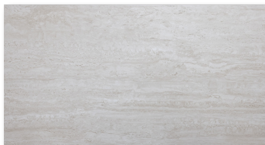
Travertino 24" x 48" Pearl (M)