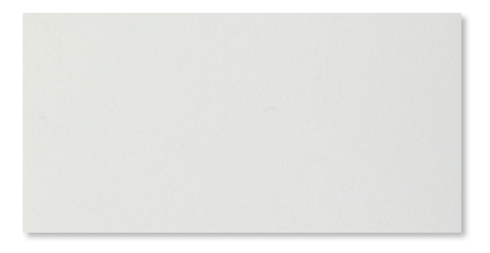
24" x 48" Mantra White (M)