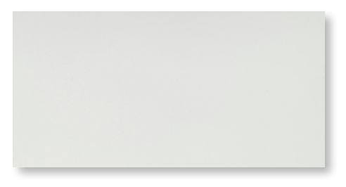
12" x 24" Mantra White