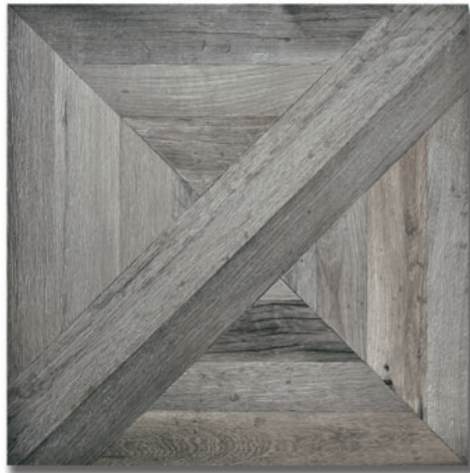
Mansion 30" x 30" Court (M) PO1831-303000