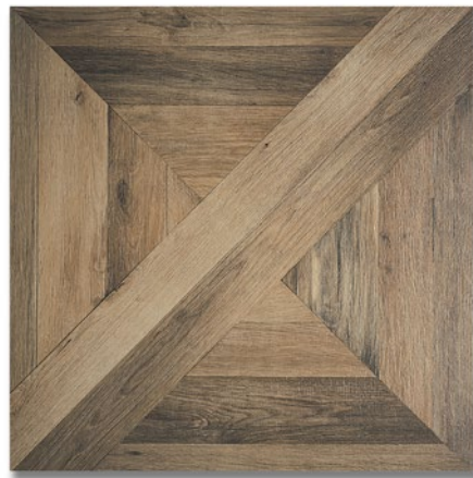
Mansion 30" x 30" Library (M) PO1833-303000