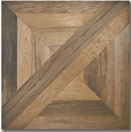
Mansion 30" x 30" Arcade (M) PO1830-303000