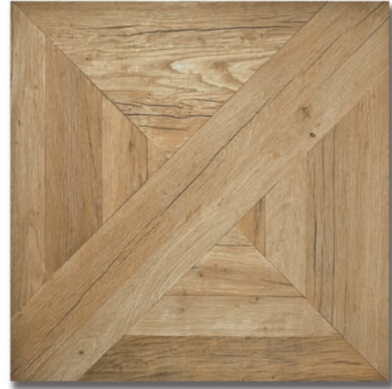
Mansion 30" x 30" Hall (M) PO1832-303000