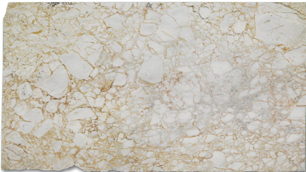
Lucent 3/4" (H) Slab MB2387-SL34H0