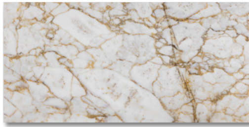
Lucent 12" x 24" (H) MB2387-1224H0