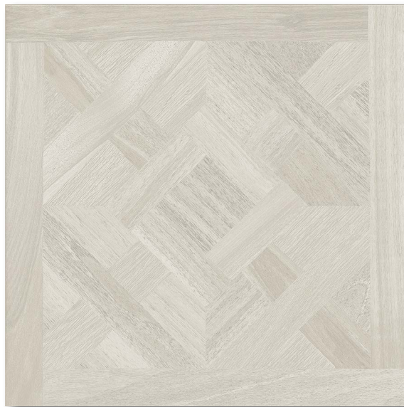
Fika 31½" x 31½" Parquet Glacier (M)