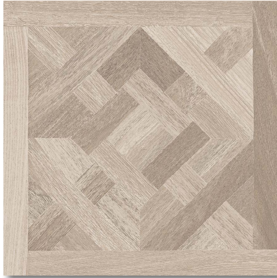
Fika 31½" x 31½" Parquet Fjord (M)