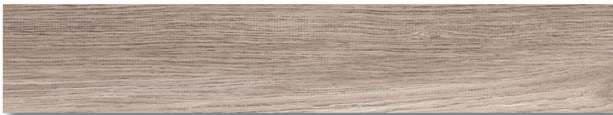
Fika 8" x 48" Fjord (M)