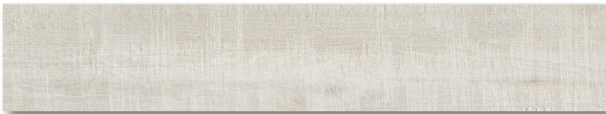
Fika 8" x 48" Glacier (M)