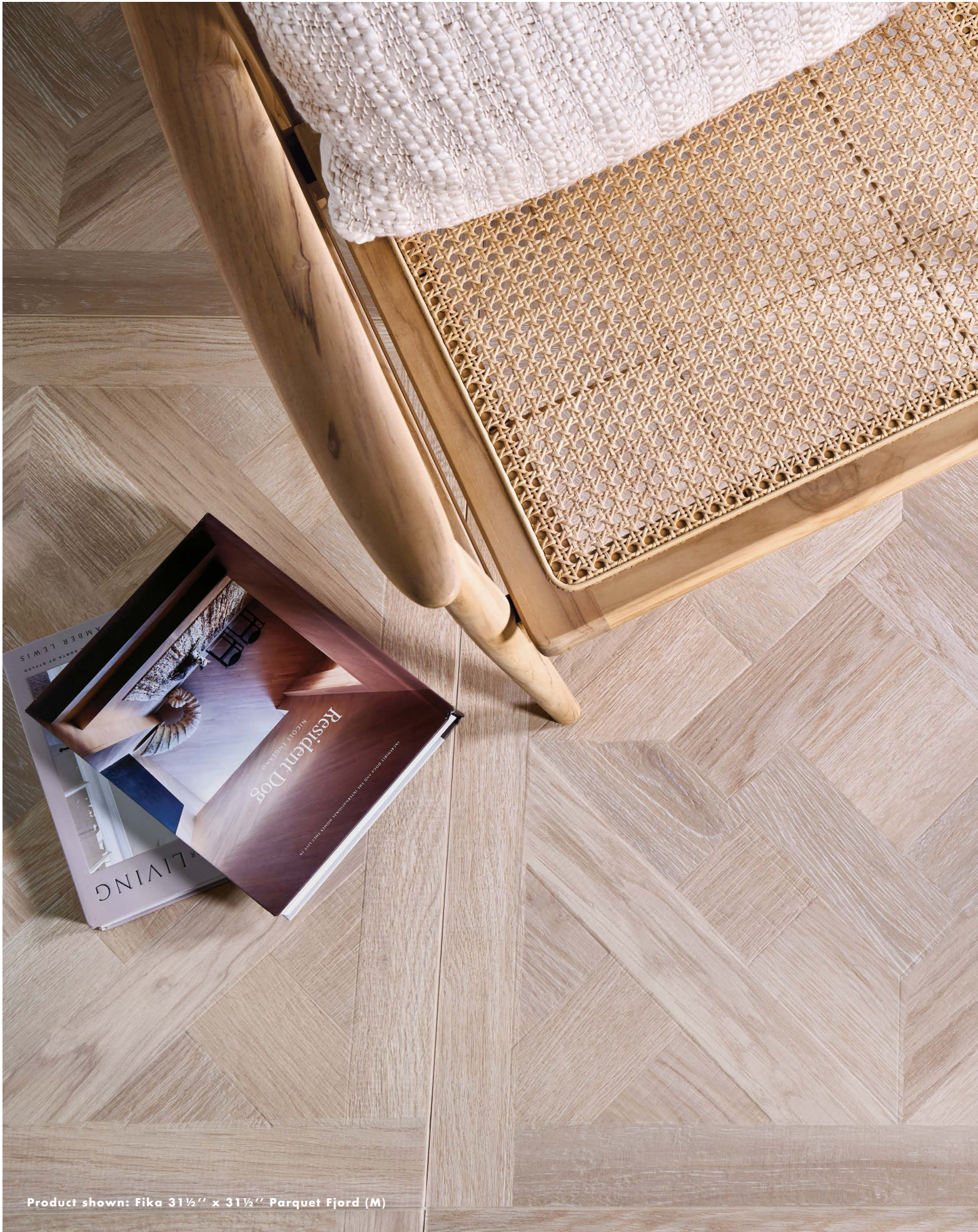
Product shown: Fika 31½" x 31½" Parquet Fjord (M)