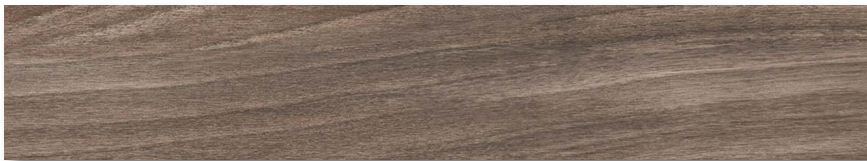
Fika 8" x 48" Cliff (M)