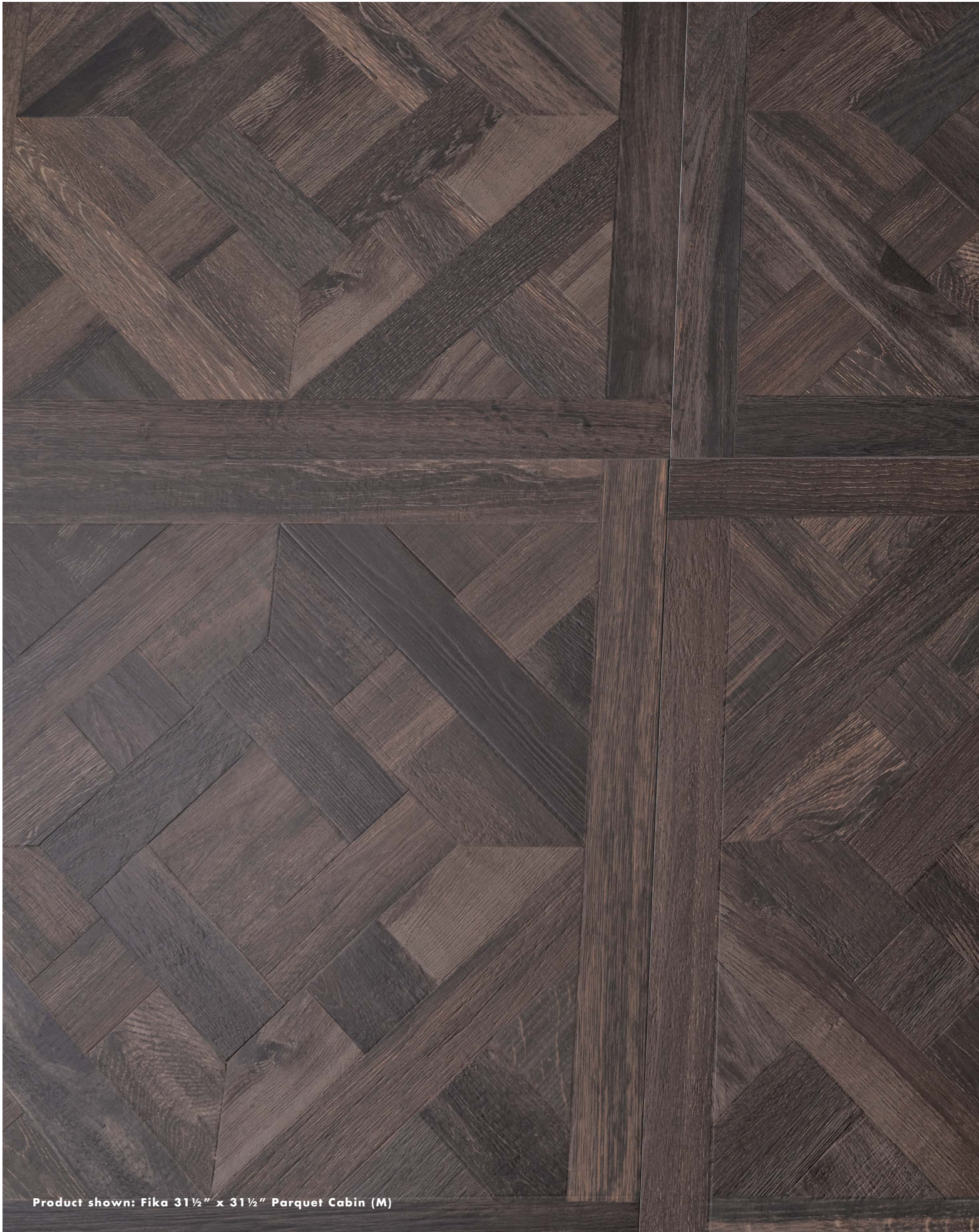
Product shown: Fika 31 1/2" x 31 1/2" Parquet Cabin (M)