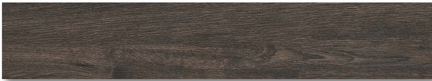
Fika 8" x 48" Cabin (M)