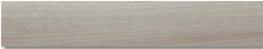
Fika 8" x 48" Boulder (M)