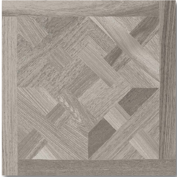
Fika 31 1/2" x 31 1/2" Parquet Boulder (M)