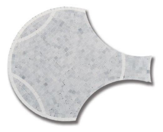
Special Order Eternity Empire Ash Gray (H) w/ Thassos (H) MB1809-EMPIH1