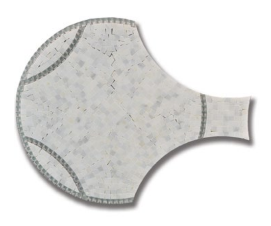
Special Order Eternity Empire Carrara Bella (H) w/ Dove Gray (C) MB1604-EMPIH1