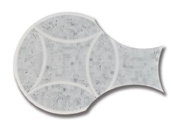
Eternity Timeless Ash Gray (H) w/ Thassos (H) MB1809-TIMEH1