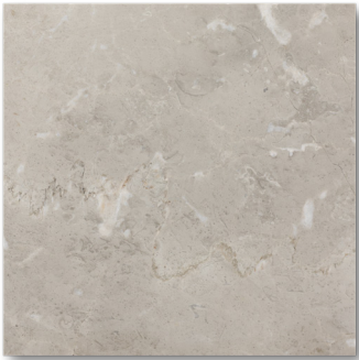
10" x 10" Coastal Gray (H) MB2568-CKBDHO