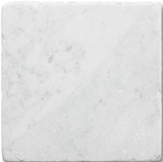
10" x 10" Carrara (Tumbled) MB1130-CKBDT0