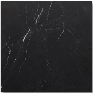
10" x 10" Tulip Black (H) MB1187-CKBDHO