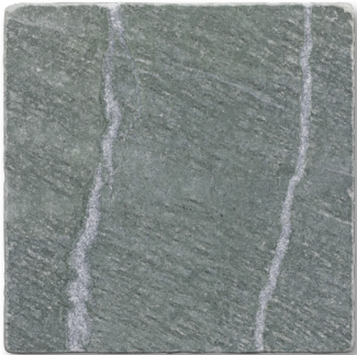
10" x 10" Moss Green (Tumbled) MB1088-CKBDT0