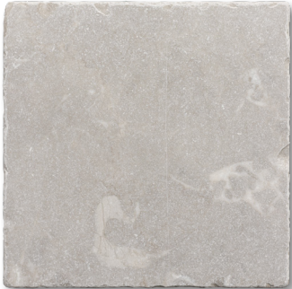
10" x 10" Coastal Gray (Tumbled) MB2568-CKBDT0