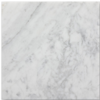
10" x 10" Carrara (H) MB1130-CKBDHO