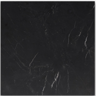
10" x 10" Tulip Black (P) MB1187-CKBDPO