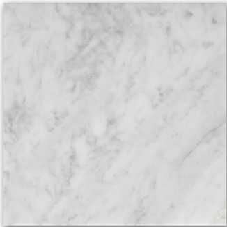
10" x 10" Carrara (P) MB1130-CKBDPO