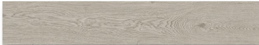
Alpine 8" x 48" Grey (M)