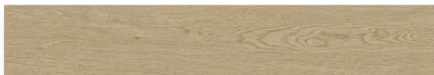
Alpine 8" x 48" Oak (M)